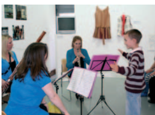
The Thorne Trio