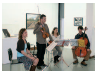
The Galeazzi Ensemble